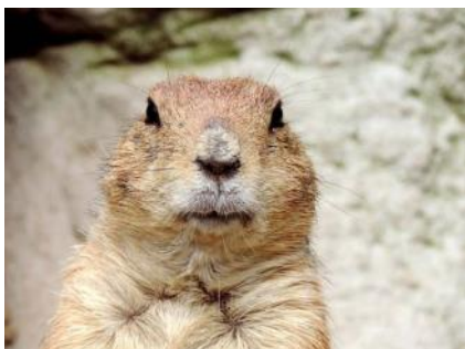
HAPPY GROUNDHOG DAY