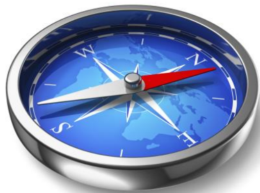
Gyroscope and a compass